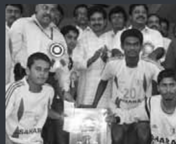
Vedanta sponsors Biju Pattnaik Memorial Trophy