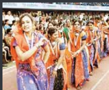
Vedanta Aluminium Ltd. sponsors National Youth Festival, Bhubaneswar