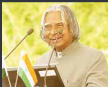
Dr. APJ Abdul Kalam visits Lanjigarh